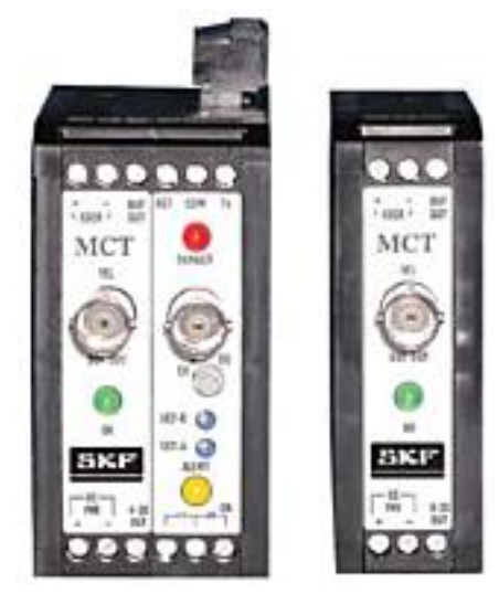
The Machine Condition Transmitter (MCT) CMSS 530(A) Velocity Module is also available as a Basic Model (pictured at right) or as a stand-alone Monitor (left).

Dependent on the type of machine and its rotational speed, other (non-ISO) filters with various corner frequencies from 2 Hz to 2.0 kHz in the broadband can be selected. Velocity is measured in Metric units (mm/s RMS) or in English units (in/s True Peak or RMS). The velocity signal directly relates to the vibration energy.