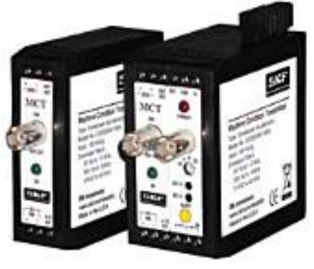
The Machine Condition Transmitter (MCT) CMSS 590(A) Enveloped Acceleration Module is also available as a Basic Model (pictured at left) or a stand-alone Monitor (right).

* Full-scale ranges are multiplied by 3.3 if 30 mV/g sensors are used and by 10.0 if 10 mV/g sensors are used.